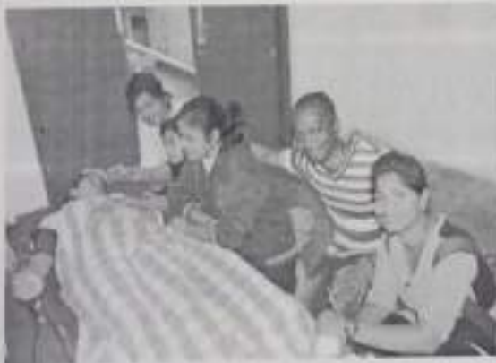
Students at Blood Donation Camp