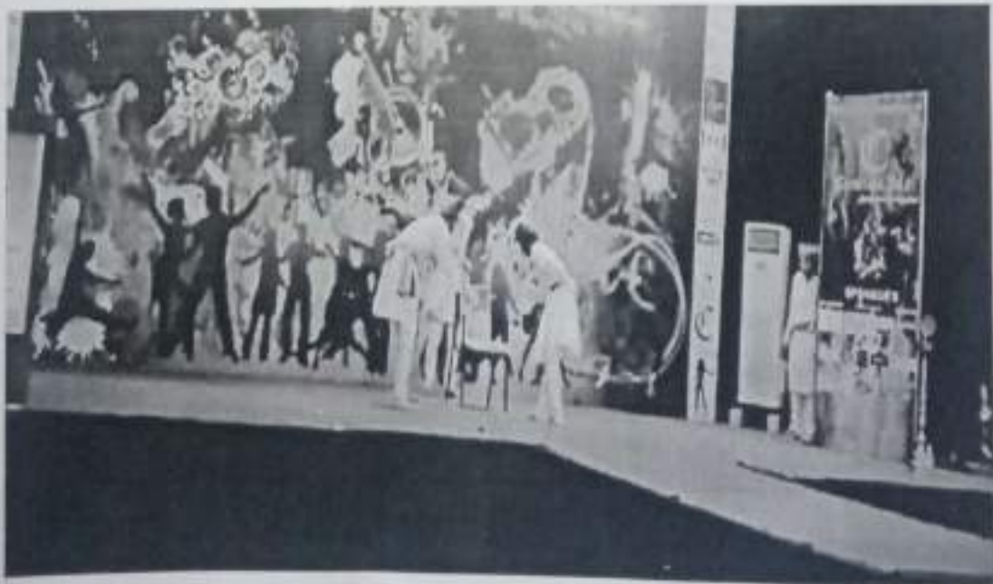
Programs performed by students on Shiv Jayanti