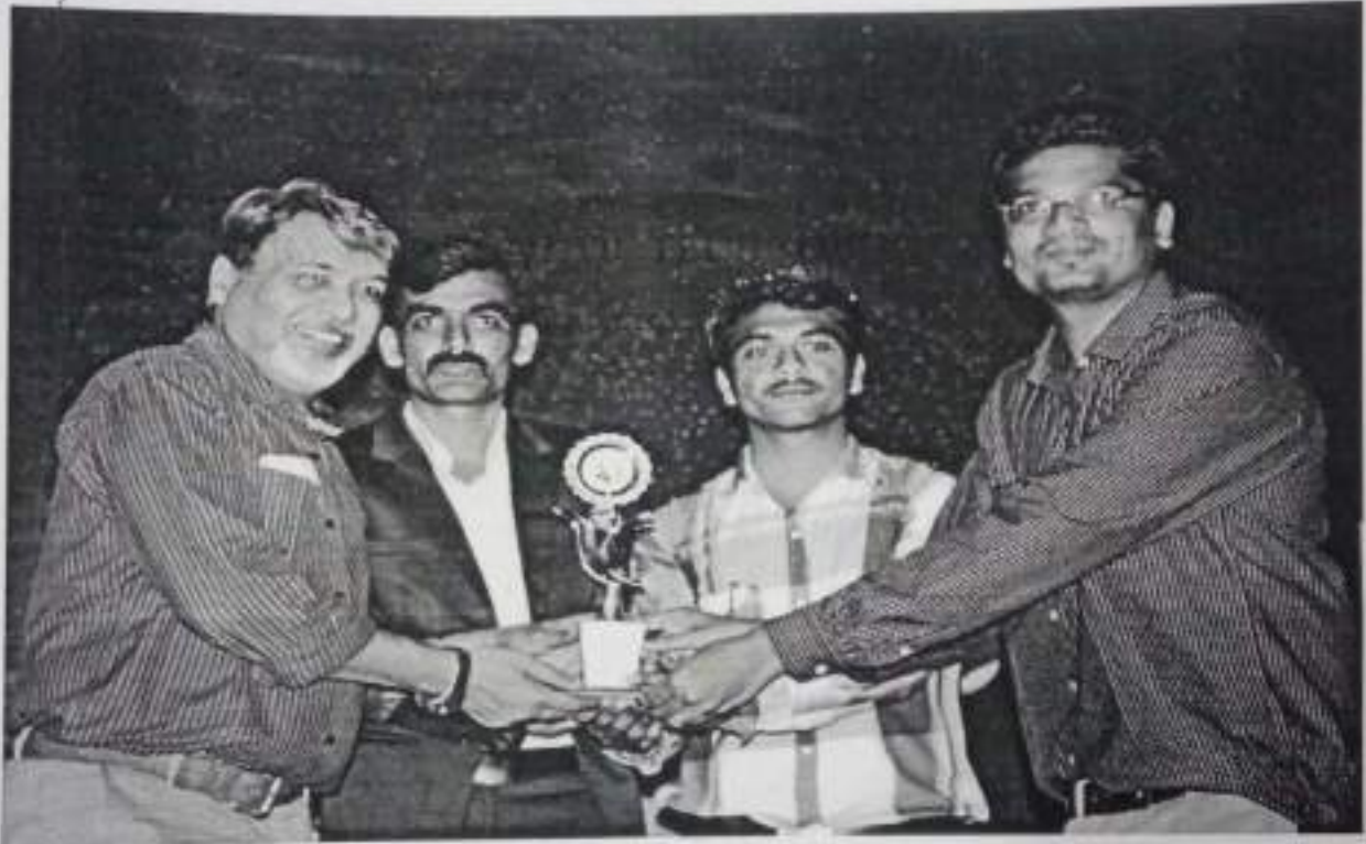
Engineer's Day Prize distribution