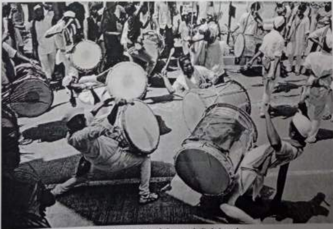
Shivaji Maharaj Jayanti Celebration