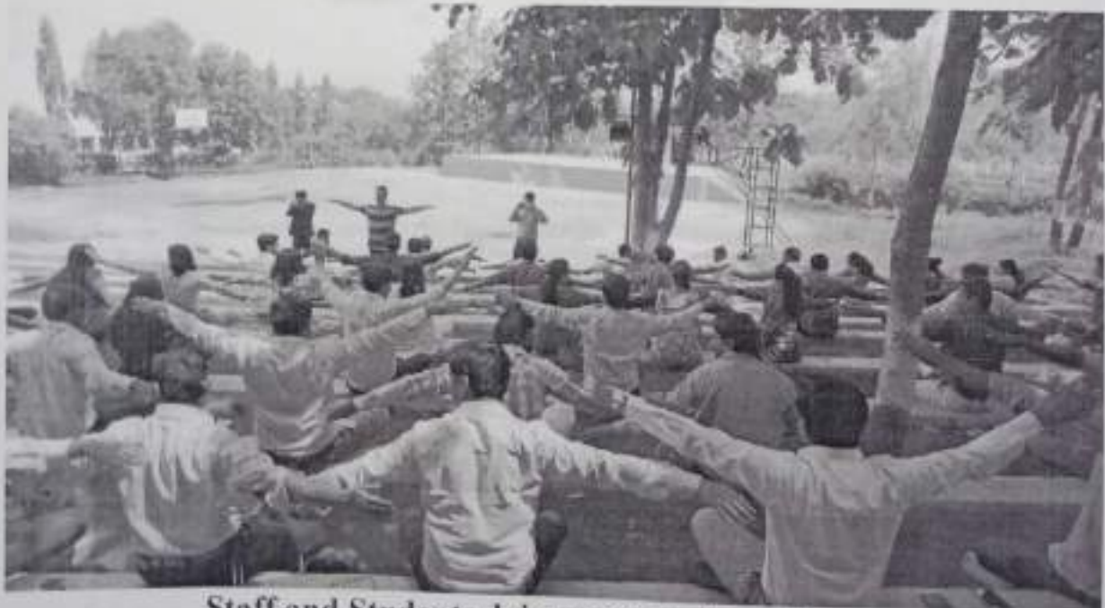
Staff and Students doing yoga on Yoga Day