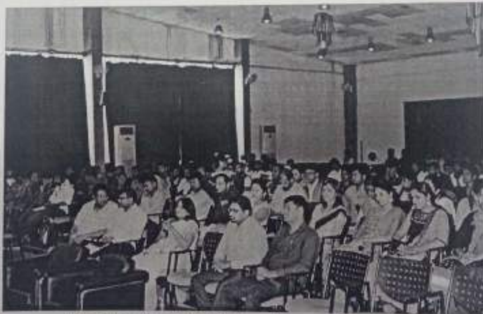
Dr. B. R. Ambedkar birth anniversary Celebration