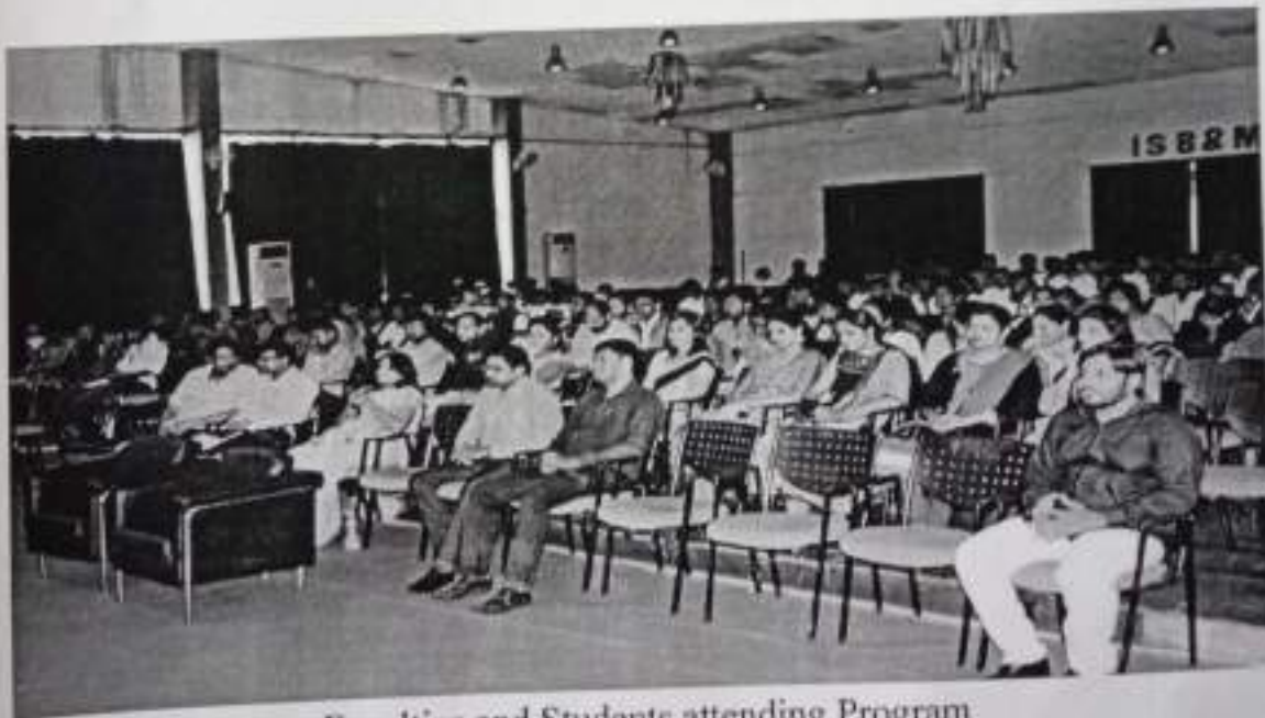
Faculties and Students attending Program