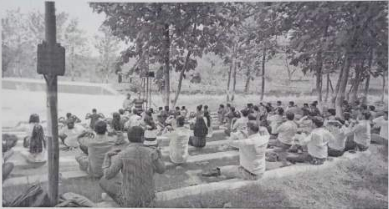
Warming session on Yoga Day