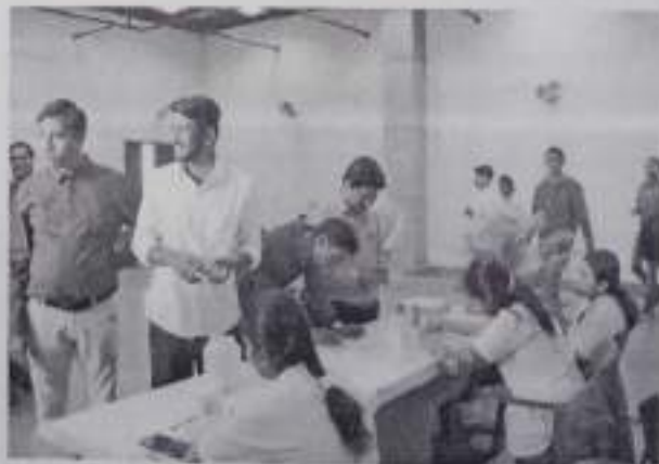
Registration Desk at Blood donation Camp