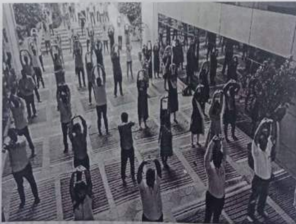
Staff and Student on Yoga Day