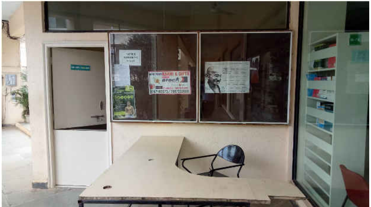
ISB&M SCHOOL OF TECHNOLOGY XEROX FACILITY