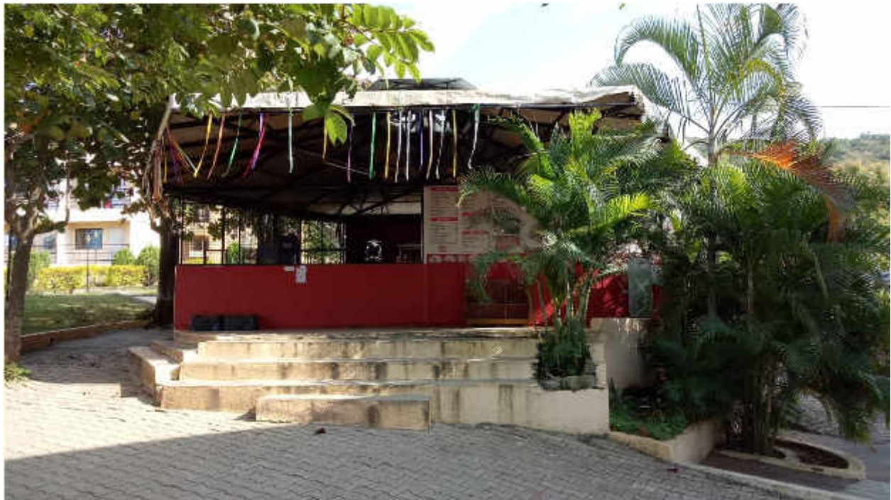
ISB&M SCHOOL OF TECHNOLOGY FOOD COURT-2