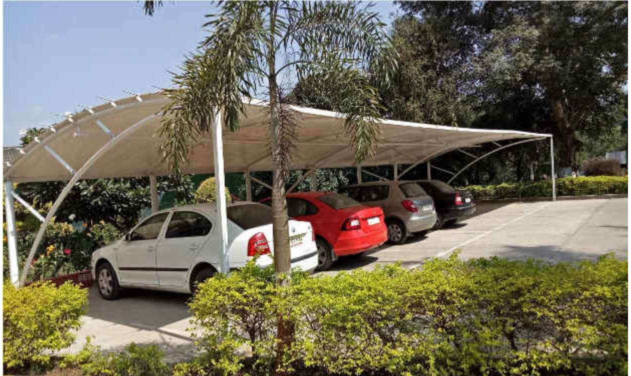
ISB&M FOUR WHEELER PARKING FOR DIRECTORS