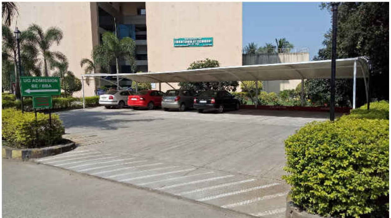
ISB&M FOUR WHEELER PARKING FOR DIRECTORS