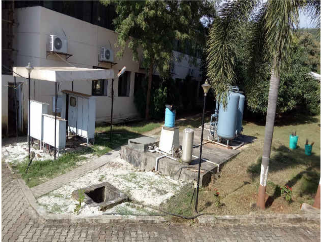
ISB&M SCHOOL OF TECHNOLOGY –WATER TREATMENT PLANT