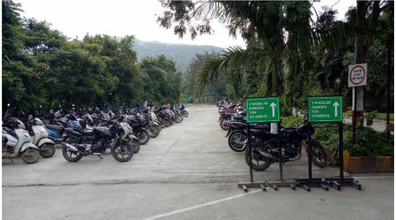
ISB&M SCHOOL OF TECHNOLOGY TWO WHEELER PARKING