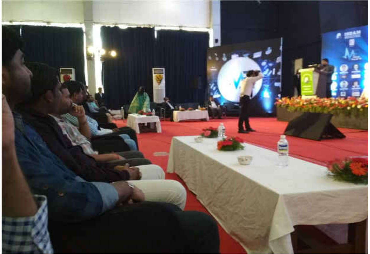
ISB&M SCHOOL OF TECHNOLOGY –AUDITORIUM