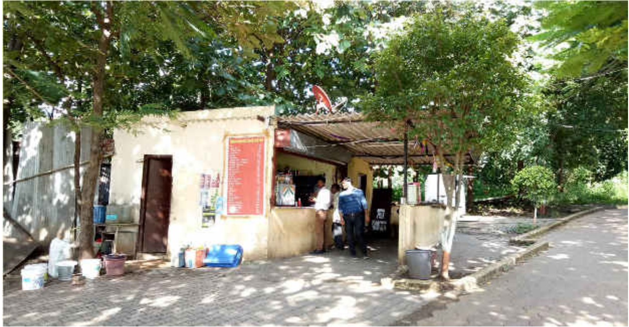
ISB&M SCHOOL OF TECHNOLOGY FOOD COURT-3