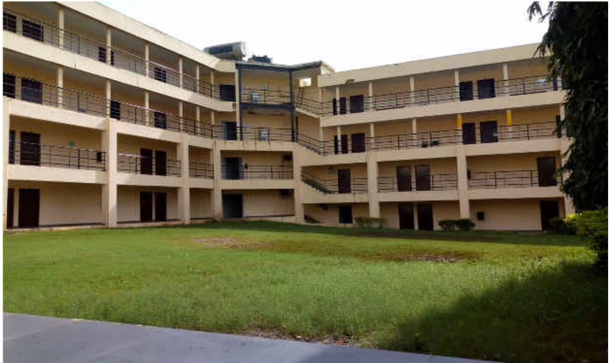
ISB&M SCHOOL OF TECHNOLOGY HOSTEL FACILITY -BOYS