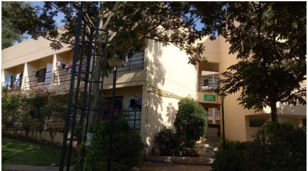
ISB&M SCHOOL OF TECHNOLOGY NANDE HOSTEL FACILITY-GIRLS