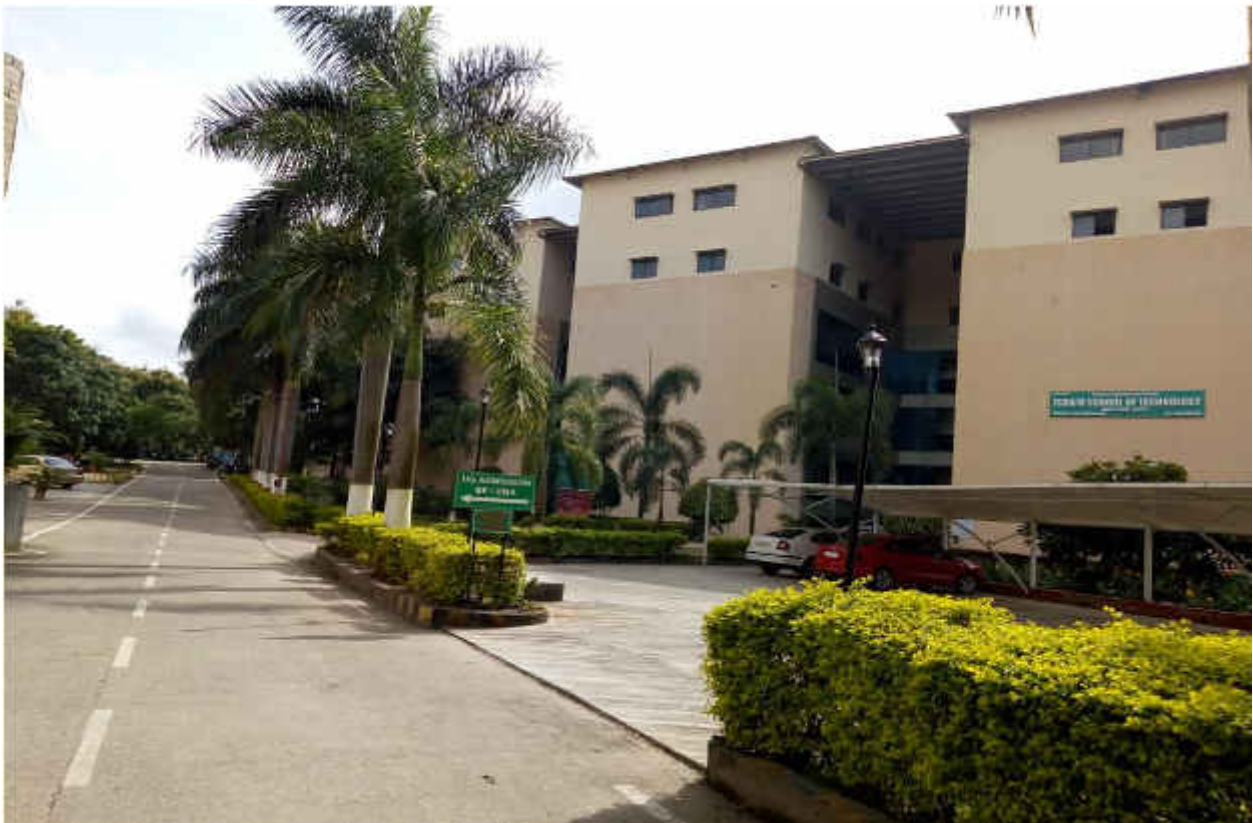
ISB&M SCHOOL OF TECHNOLOGY NANDE