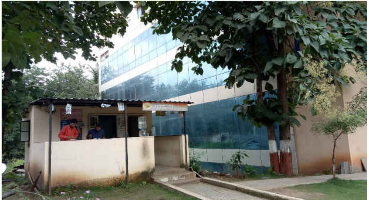
ISB&M SCHOOL OF TECHNOLOGY FOOD COURT-1