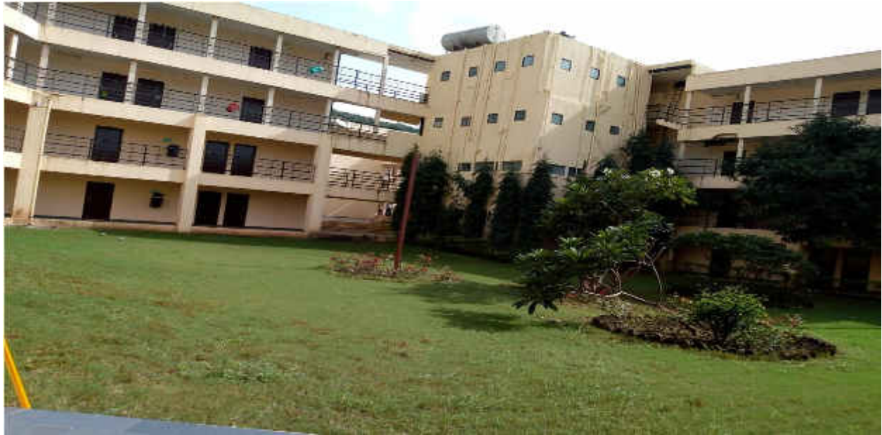
ISB&M SCHOOL OF TECHNOLOGY NANDE HOSTEL FACILITY-GIRLS