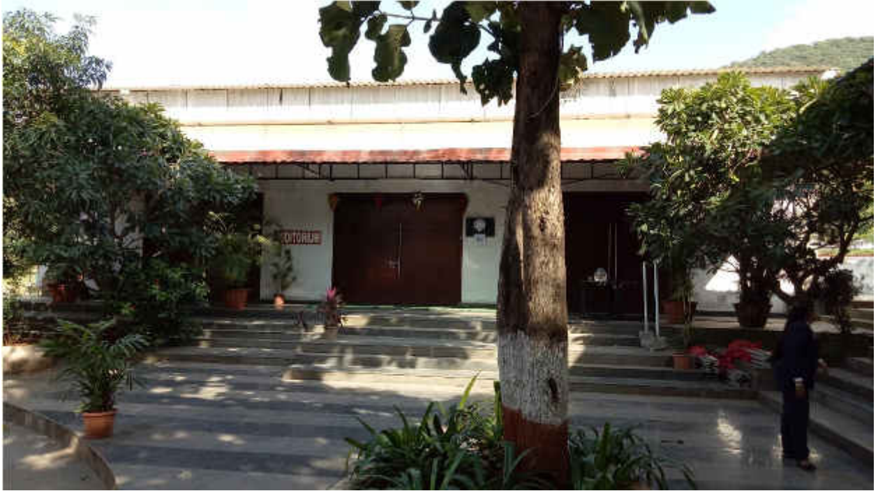
ISB&M SCHOOL OF TECHNOLOGY –AUDITORIUM