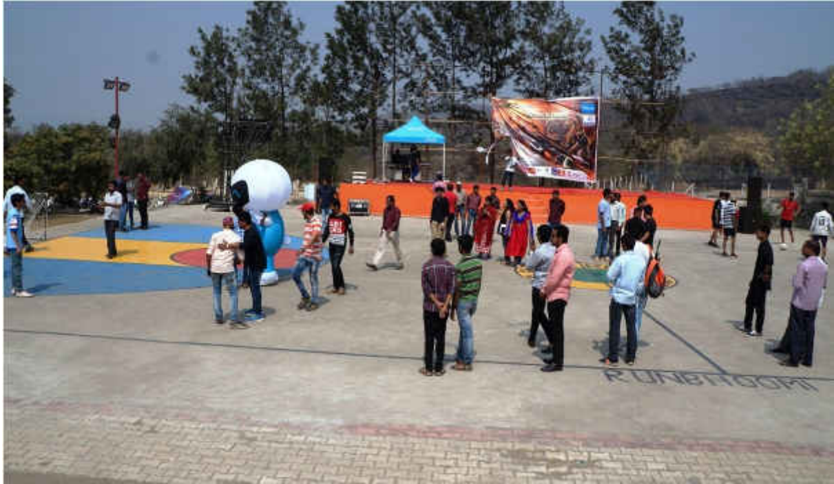
ISB&M SCHOOL OF TECHNOLOGY PLAYGROUND