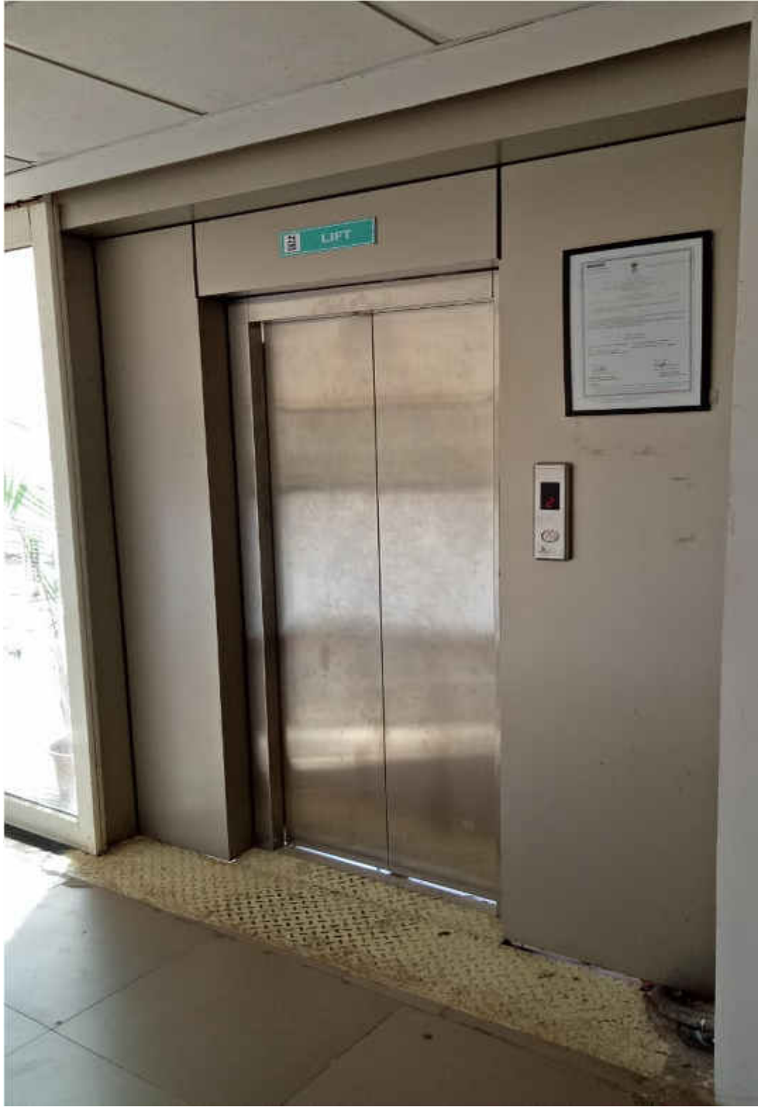
ISB&M SCHOOL OF TECHNOLOGY LIFT