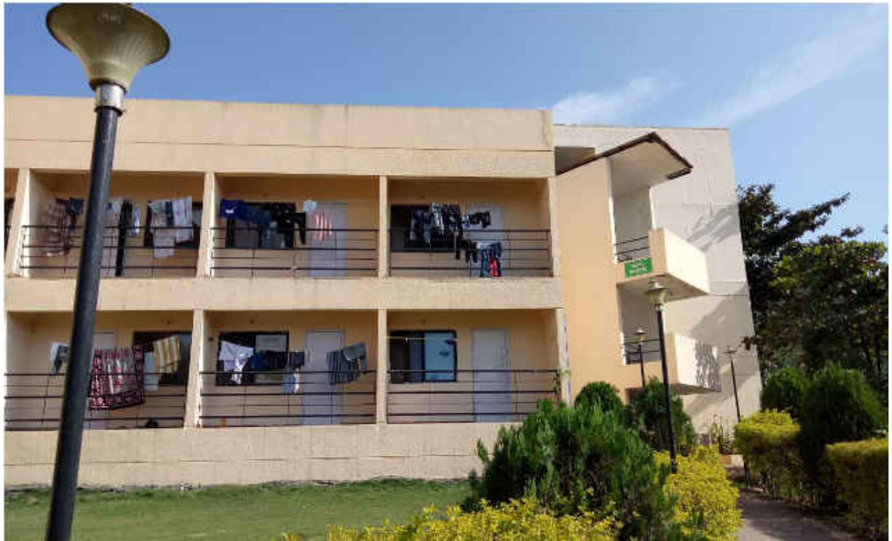
ISB&M SCHOOL OF TECHNOLOGY HOSTEL FACILITY -BOYS