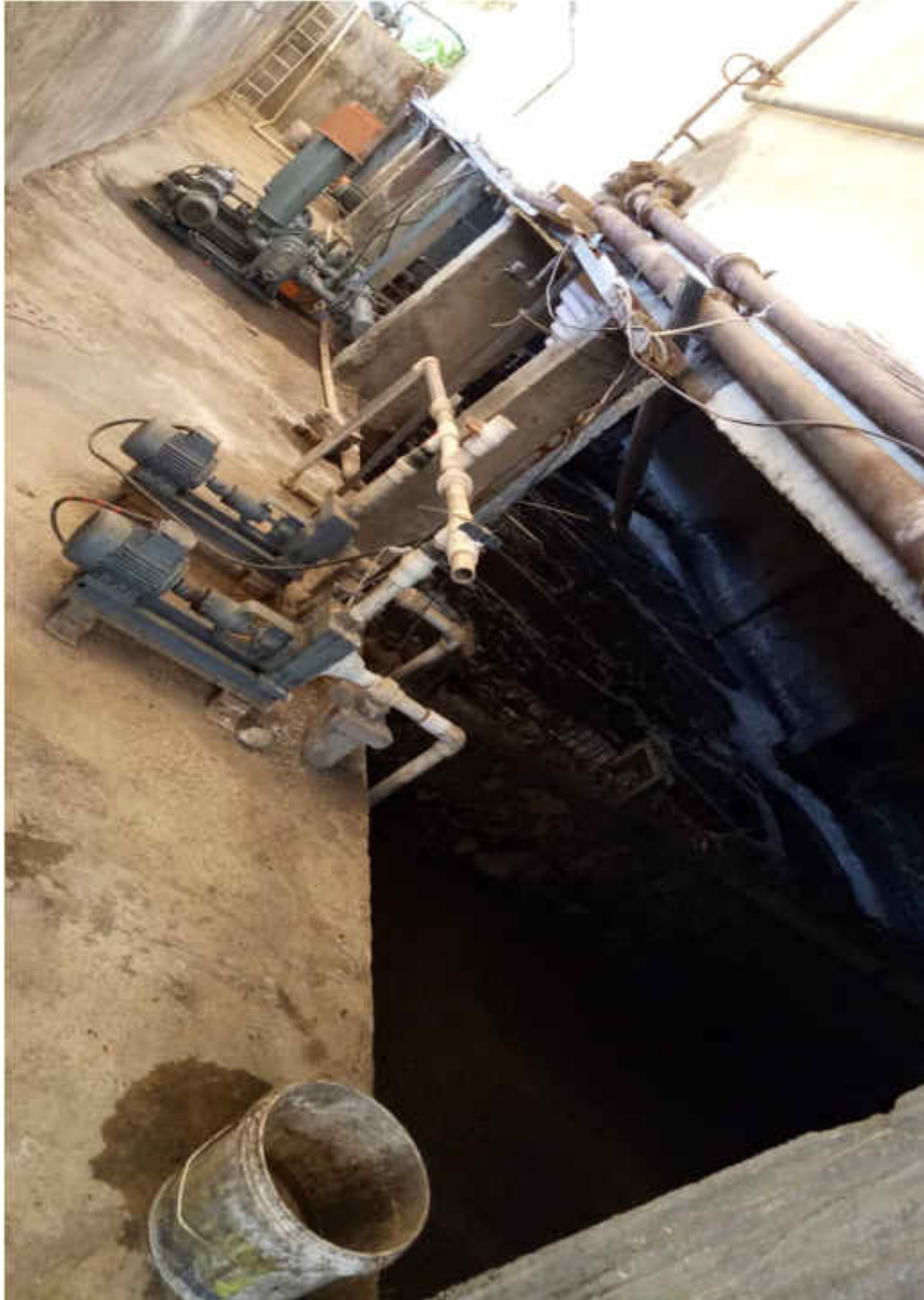
ISB&M SCHOOL OF TECHNOLOGY –SEWAGE TREATMENT PLANT