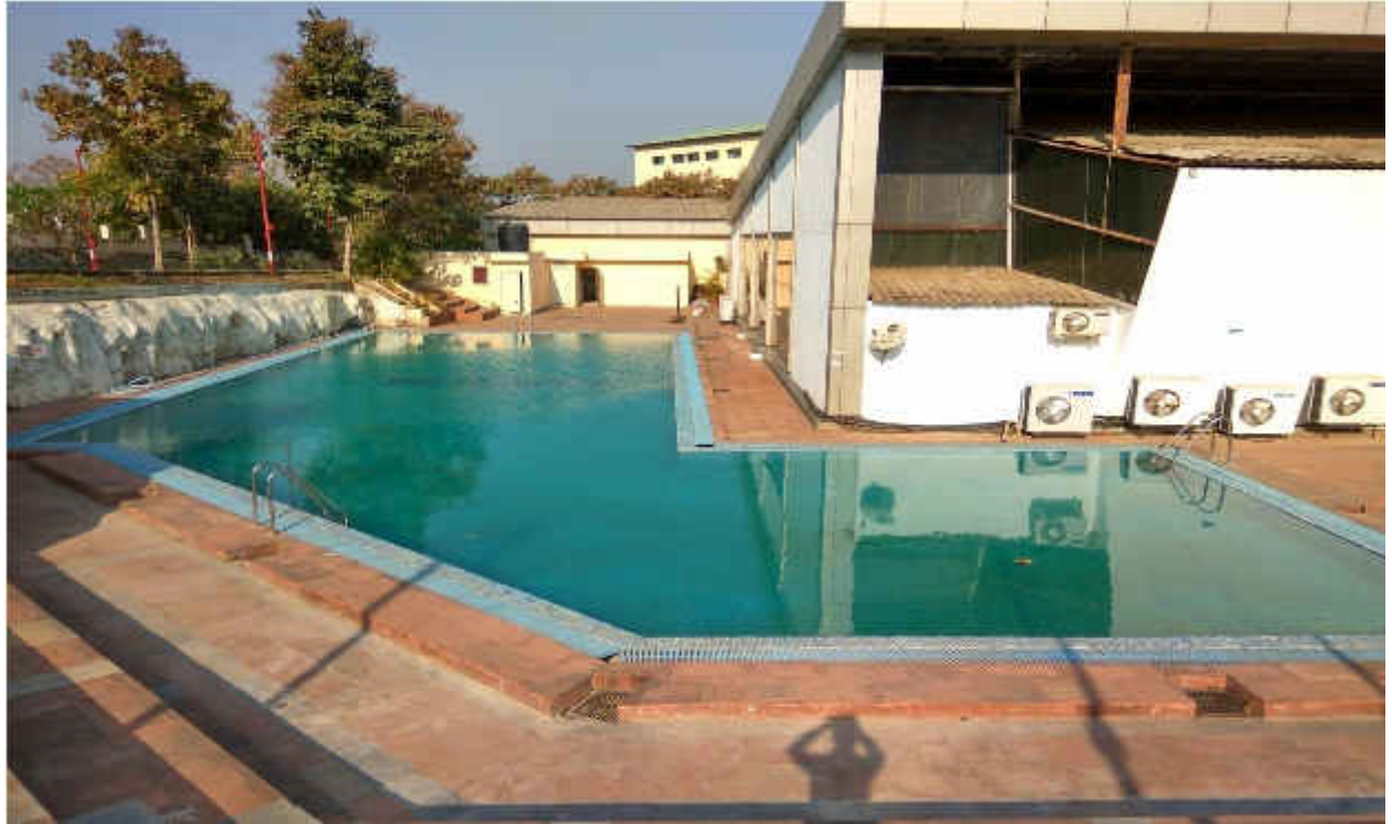
ISB&M SCHOOL OF TCHNOLOGY SWIMMING POOL