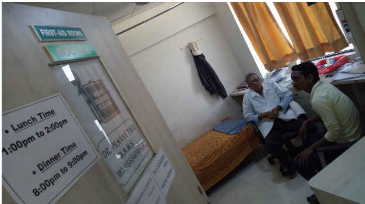
ISB&M SCHOOL OF TECHNOLOGY-DOCTOR FACILITY