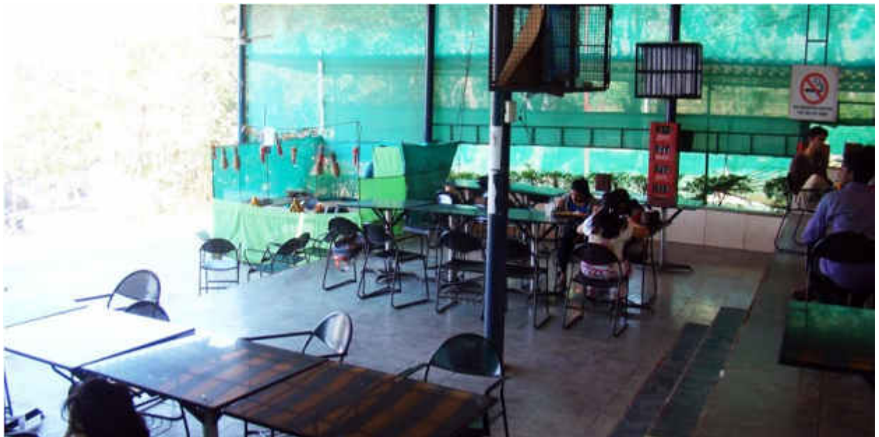
ISB&M SCHOOL OF TECHNOLOGY CAFETAREA