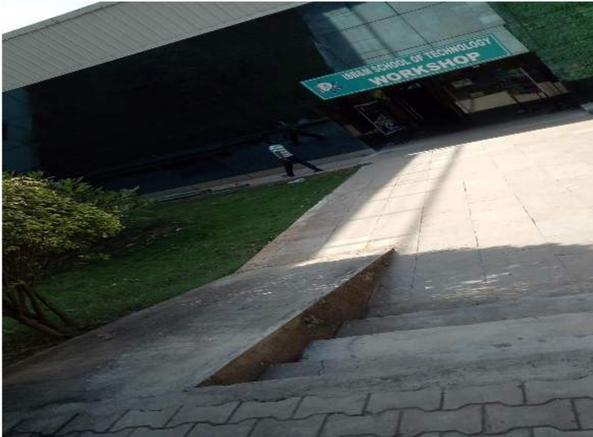
ISB&M SCHOOL OF TECHNOLOGY WORKSHOP