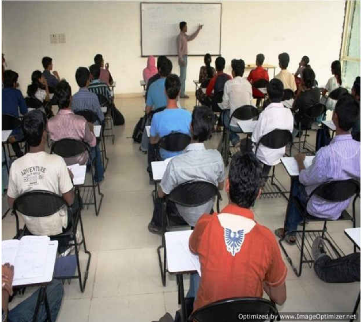
ISB&M SCHOOL OF TECHNOLOGY TUTORIAL ROOM