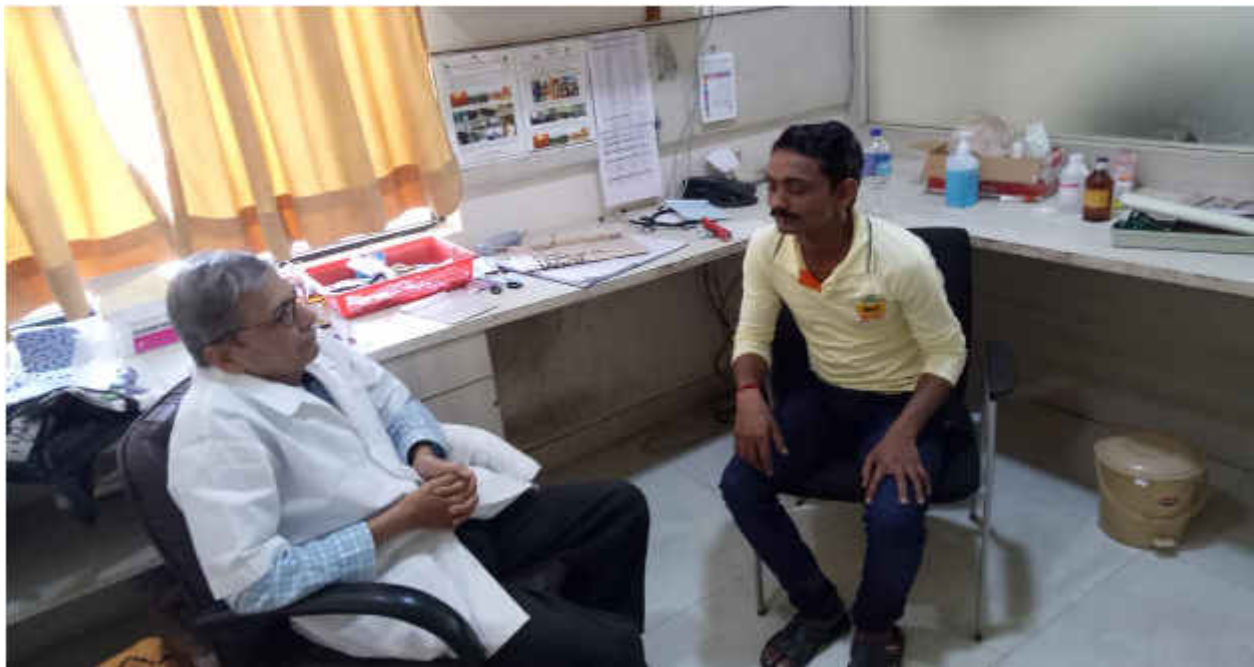
ISB&M SCHOOL OF TECHNOLOGY-DOCTOR FACILITY